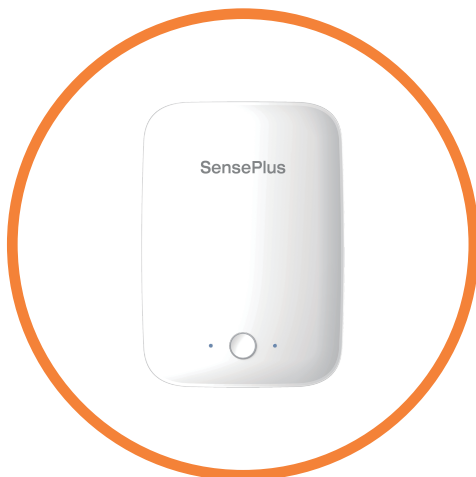
跌倒偵測感應器 Fall Detection Sensor

Through our mobile application, the following devices can monitor the health status of the elderly in real-time, provide instant alerts and data analysis, helping the elderly to live safely and healthily.