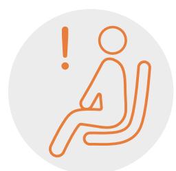
久坐警報 Sedentary Alert