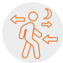
晚間遊走 Night Wandering