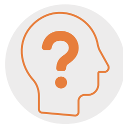
日間遊走 Day Wandering