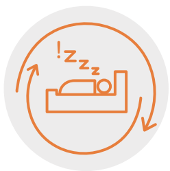
久睡警報 Oversleeping Alert