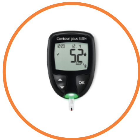
血糖機 Glucose Meter