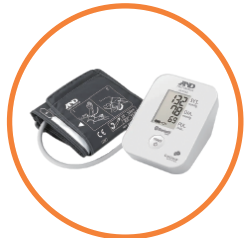
血壓計 Blood Pressure Monitor