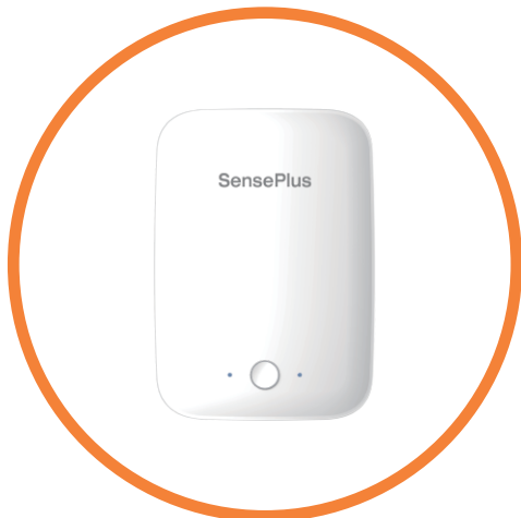
跌倒偵測感應器 Fall Detection Sensor

Through our mobile application, the following devices can monitor the health status of the elderly in real-time, provide instant alerts and data analysis, helping the elderly to live safely and healthily.