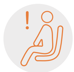
久坐警報 Sedentary Alert